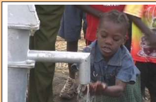
Borehole Drilled at Simatobolo Oct 08 Funded by Hatch Beauchamp School & Church & with donation of £500 from Helston Rotary