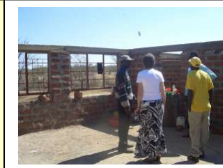
Visit June 08