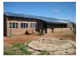
Nearly complete Mar 09

This school was linked with Hatch Beauchamp Primary school in Dec 2006. Following a visit there in July 2007 when we were impressed by the enthusiasm and dedication of the volunteer teachers, we started to raise funds for a new school building , to replace the very small mud hut that was falling down.