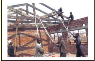
Roof timbers Sept 08