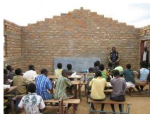
Buiketo school. waiting for a roof.