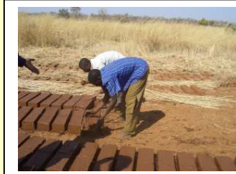
Parents make bricks