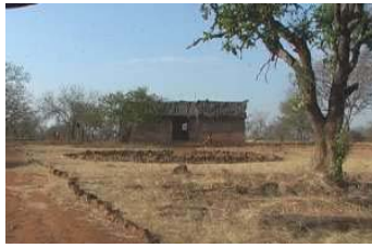
Old school building

This school was linked with Hatch Beauchamp Primary school in Dec 2006. Following a visit there in July 2007 when we were impressed by the enthusiasm and dedication of the volunteer teachers, we started to raise funds for a new school building , to replace the very small mud hut that was falling down.