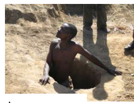
A man digging for water using his bare hands (north Zambia)

Skelton Newby Hall Sch are raising £1600 to sponsor a teacher