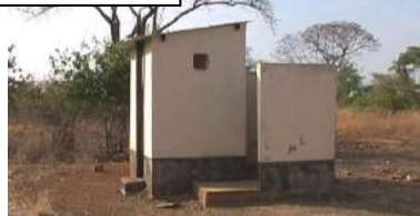
Jul -Aug 09

4 school toilets are being built, funded by West Hatch Church